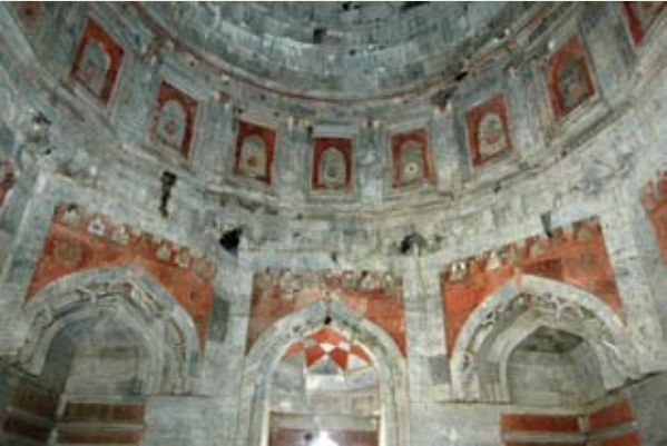
Interior ceiling Tomb of Ibrahim Sur in Narnaul, India. 1542