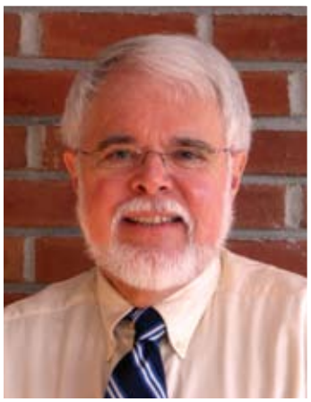
Professor of Art History, University of Massachusetts, Amherst

Water and Water Imagery in Architecture and the Arts in Ottoman Times