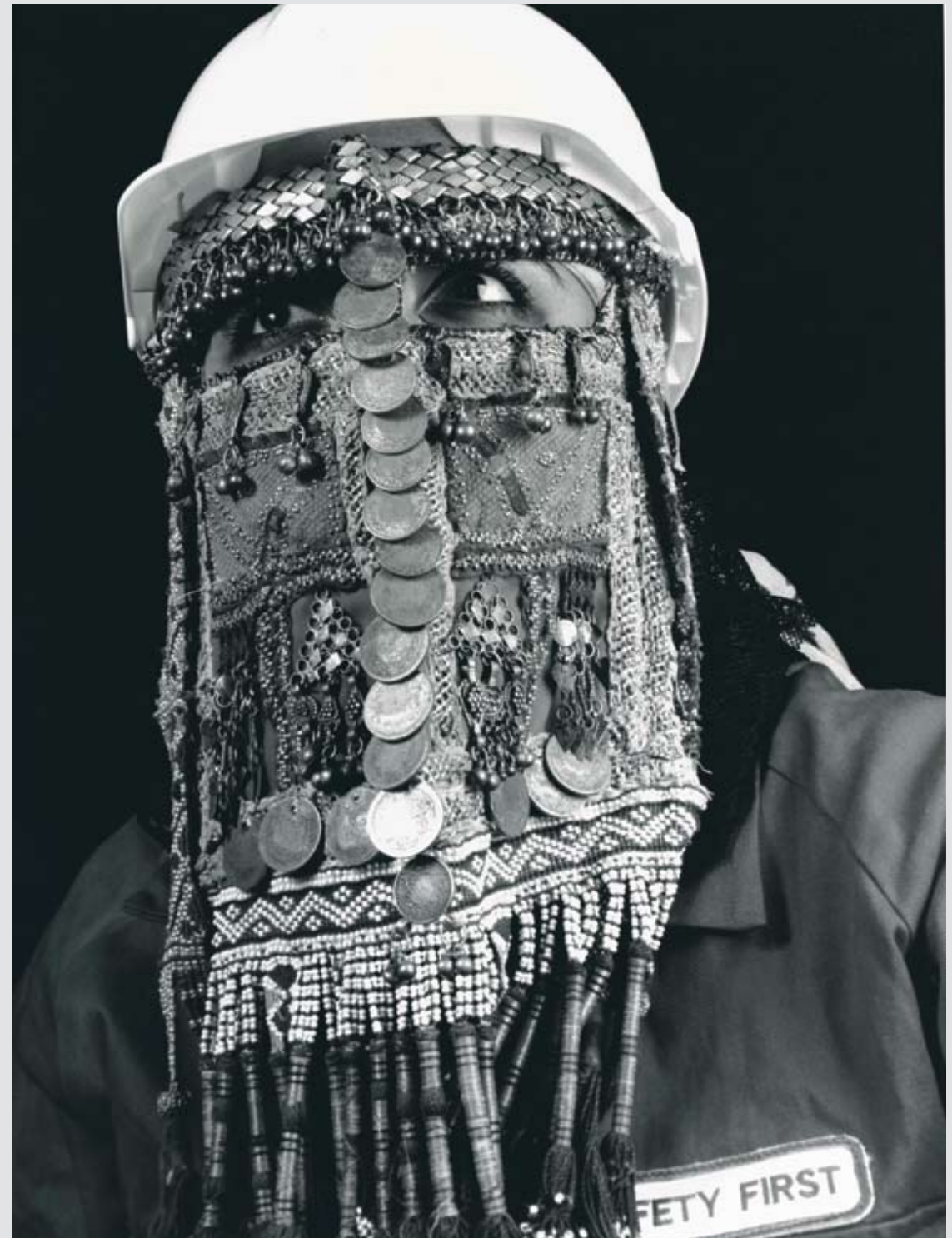
I am...a Petroleum Engineer by Manal Al Dowayan