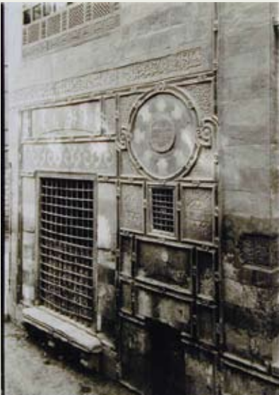
Sabil of Azbak al-Yusufi, Cairo, 1495 (K.A. C Creswell)