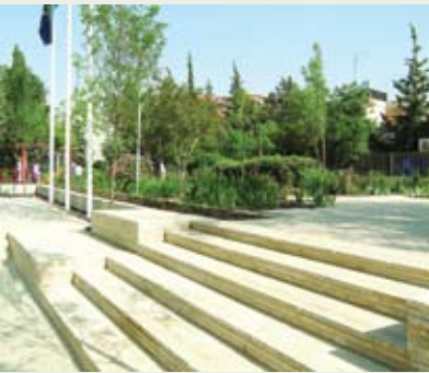
The central platform of the National Gallery of Fine Arts Park.

Old Houses of Jordan: Amman, 1920–1950 (Amman: TURAB, 1997)