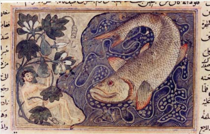
Jonah and the whale Rashid al-Din, Jami’ al-tawarikh, 1314 AD, Edinburgh. University Library, Ms. Arab 20, folio 23v.