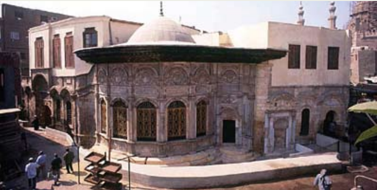
Complex of Sabil Muhammad Ali Pasha