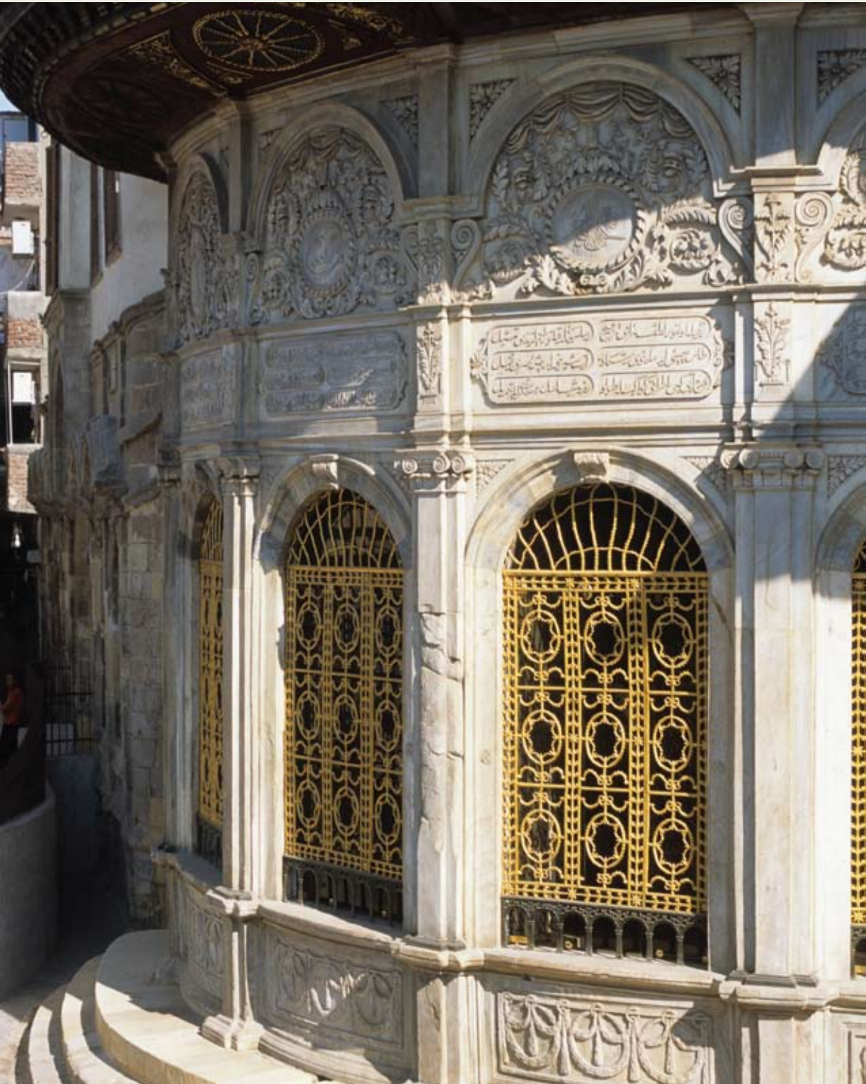
The style of Muhammad Ali Sabil was a complete novelty when it was built.