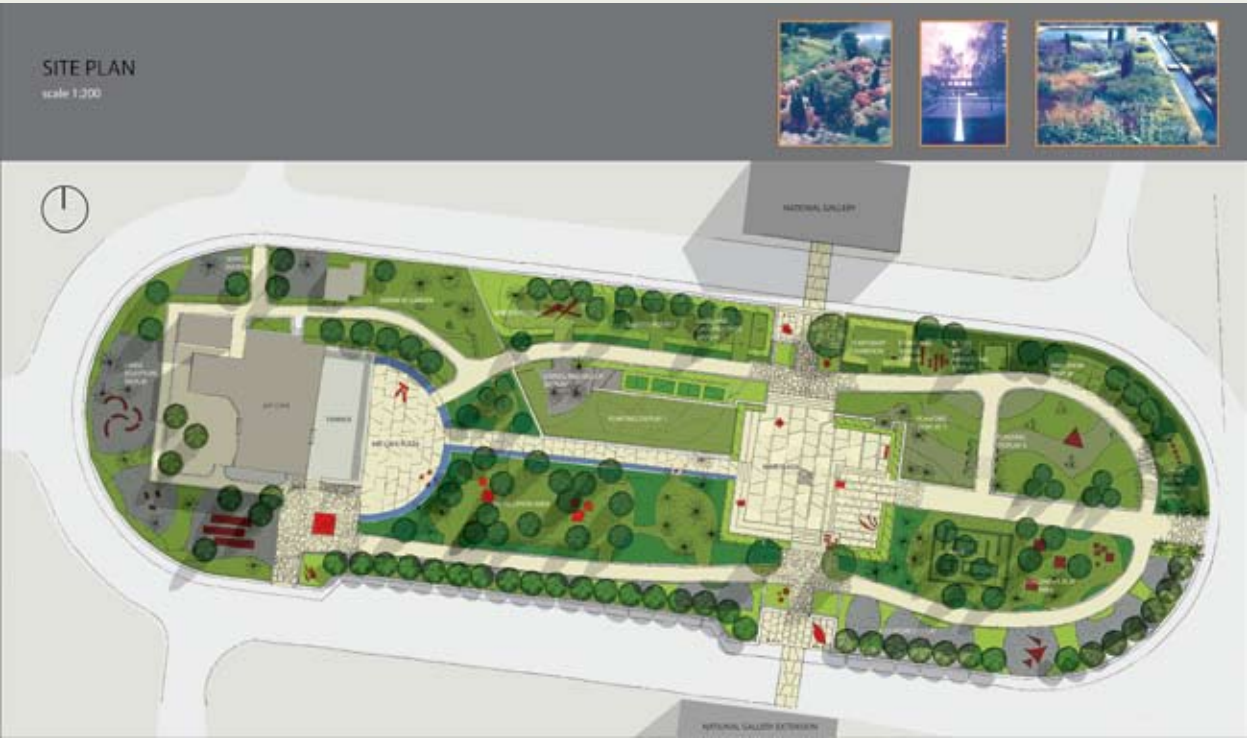
Site plan for the National Gallery of Fine Arts Park.