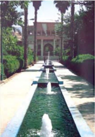
Water Canal in the Bagh-E Delgosha Shiraz (Iran)

The Qur’anic botanic gardens project facilitates linkages between traditional Islamic respect for natural habitats, the cultures inspired by the Holy Books of Islam and protection of environment and biological diversity. The establishment of new gardens influenced by scientific and cultural concepts from the Islamic civilizations and from oral and written masterpieces of the Islamic cultures, particularly from the Holy Qur’an, can realize a physical embodiment of garden traditions and preserve the botanic diversity of the regional environment. Furthermore, the project makes possible the development of shared strategies and programs focused on the improvement of education and environmental awareness within a framework of sustainable and peaceful development.