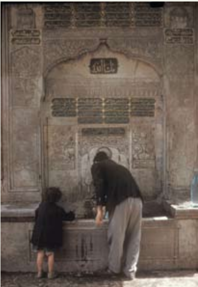
Cheshme fountain of Bereket Zade Istanbul, Turkey, 18th century