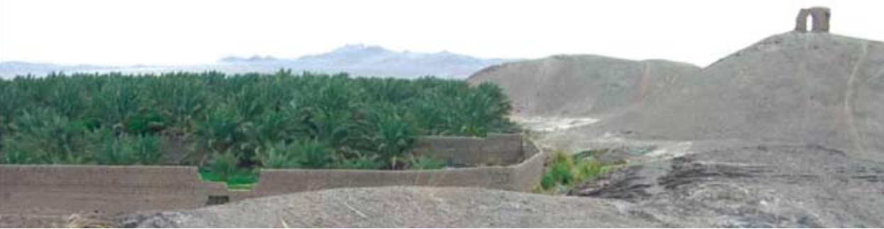
Traditional Arab Date Palm Garden surrounded by mud walls Tayma (Saudi Arabia)

UNESCO Office in Doha has recently presented the project at the second Arab Botanic Gardens Meeting held in Amman in March 2007, under the auspices of His Royal Highness Prince Hamzah Bin al Hussein, and supported by Her Royal Highness Princess Basma Bint Ali. The first Qur’anic Botanic Garden will be established in Sharjah (United Arab Emirates), thanks to the benevolence of His Highness Dr. Sheikh Sultan Bin Mohammed Al Qassimi, who has offered a donation to undertake the project in his country. UNESCO Office in Doha has established an International Advisory Committee that has already developed comprehensive technical guidelines specifying the technical requirement of the garden. Currently, the Office is developing the master plan for this garden and will complete it by the end of 2007.