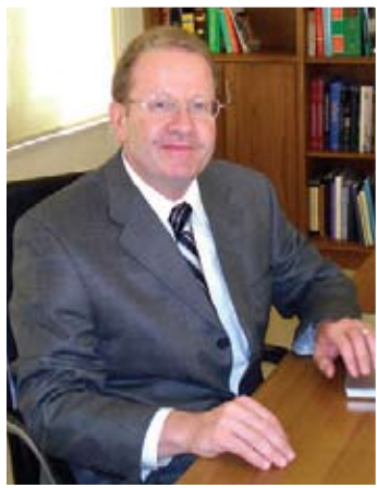
Dean of Faculty and Deputy Head, Kings Academy in Madaba, Jordan