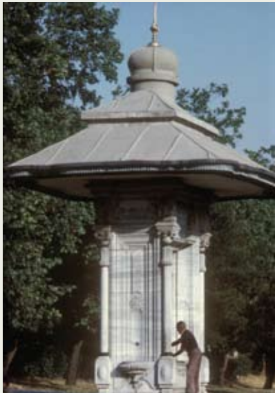
Cheshme fountain at Machka, Istanbul 19th century

After undergraduate study at Robert College (Istanbul), Grinnell College, the State University of Iowa and Oberlin College, he received his B.A. cum laude from Oberlin in 1964. He pursued graduate study at Istanbul Technical University and Harvard University, receiving his MA and Ph.D. from Harvard in 1965 and 1971.