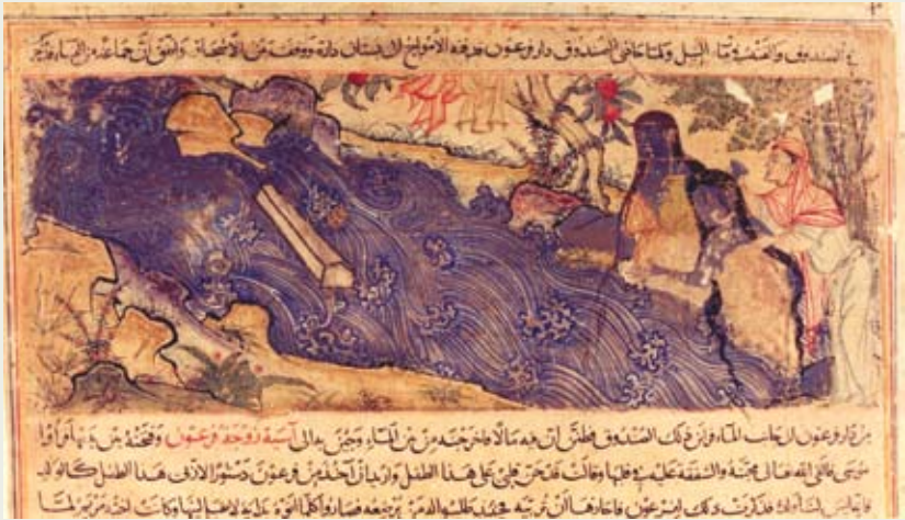
The infant Moses in a basket on the Nile Rashid al-Din, Jami’ al-tawarikh, 1314 AD, Edinburgh. University Library, Ms. Arab 20, folio 7v.