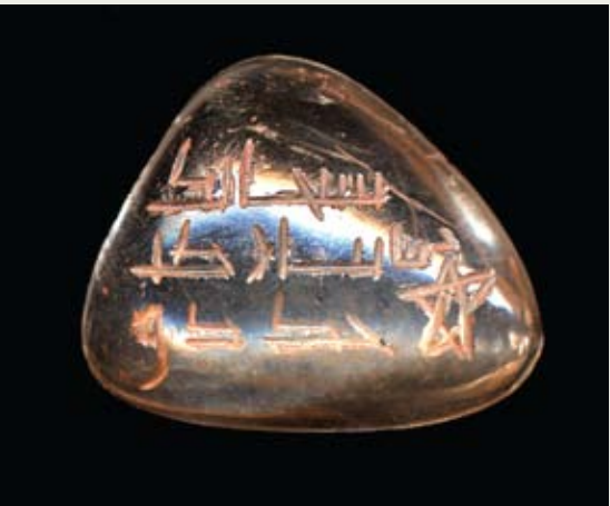
Triangular rock crystal seal (photo reversed) with Arabic inscriptions and a five-pointed star known as “Solomon’s seal.” British Museum OA+14325.