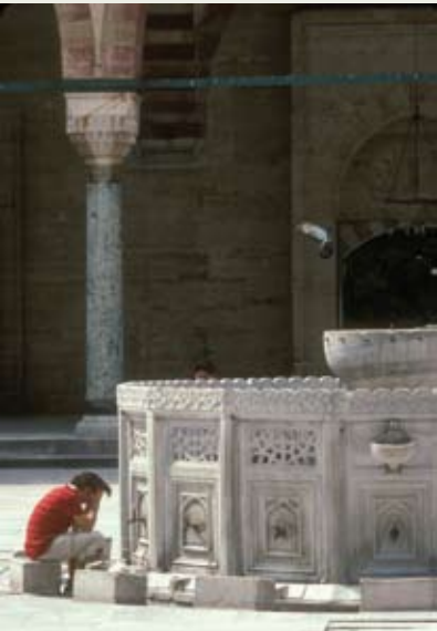
Shadirvan fountain, Selim II Mosque Edirne, Turkey, 1572