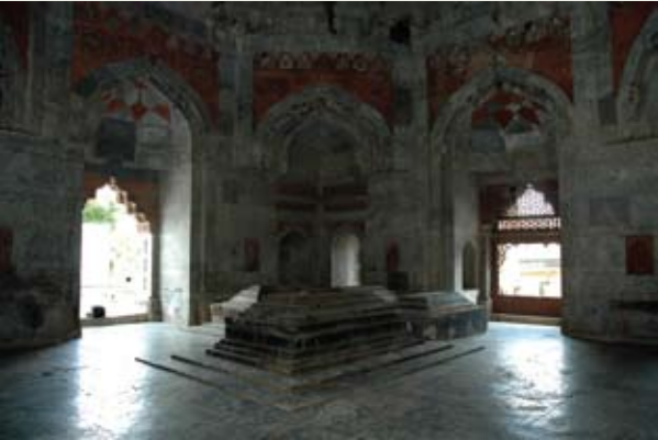
Interior Tomb of Ibrahim Sur in Narnaul, India. 1542