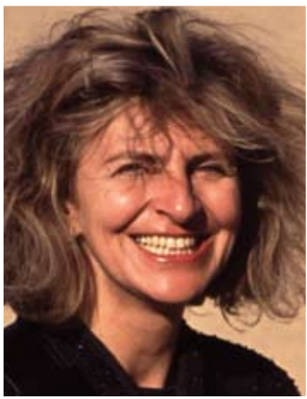
Conservation Architect, Egypt

Architecture as a Message: the Sabil of Muhammad ‘Ali Pasha in Cairo