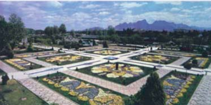
Modern Persian Garden based on the Chahar Bagh Traditional Concept Isfahan (Iran)