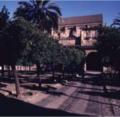
The courtyard of the Great Mosque of Cordoba, cultivated with orange and palm trees.