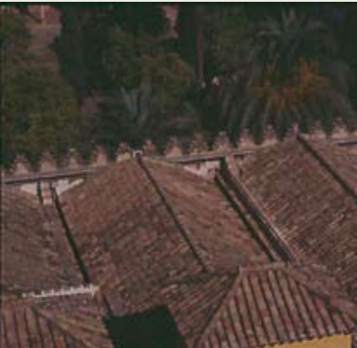
The mosque’s peaked roofs drain into runnels that pour water into the courtyard, irrigating the trees and recharging the underground cisterns.

(Gardner Films, 2007). Her current research projects are a volume of sources and documents on Islamic art and visual culture and a study of the history of arts patronage by women in the Islamic world.