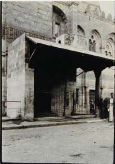
Sabil of al-Nasir Muhammad ibn Qalawun, Cairo, 1326