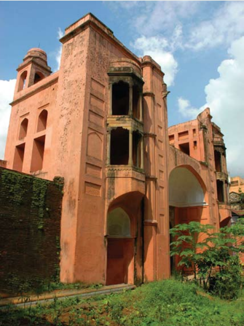
South gate, Lalbagh Fort, Dhaka 17th century