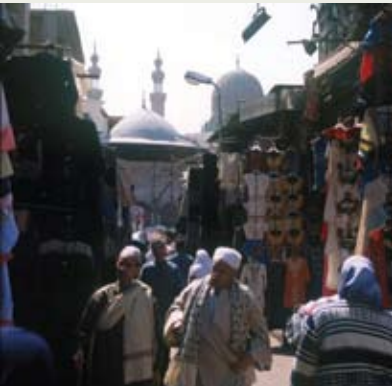
Muizz Liddin Allah Street in the heart of mediaeval Cairo