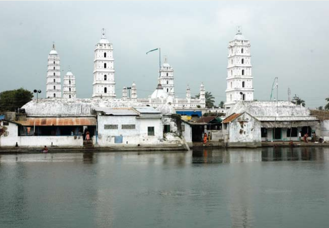
Shrine of Shahul Hamid in Nagore, India