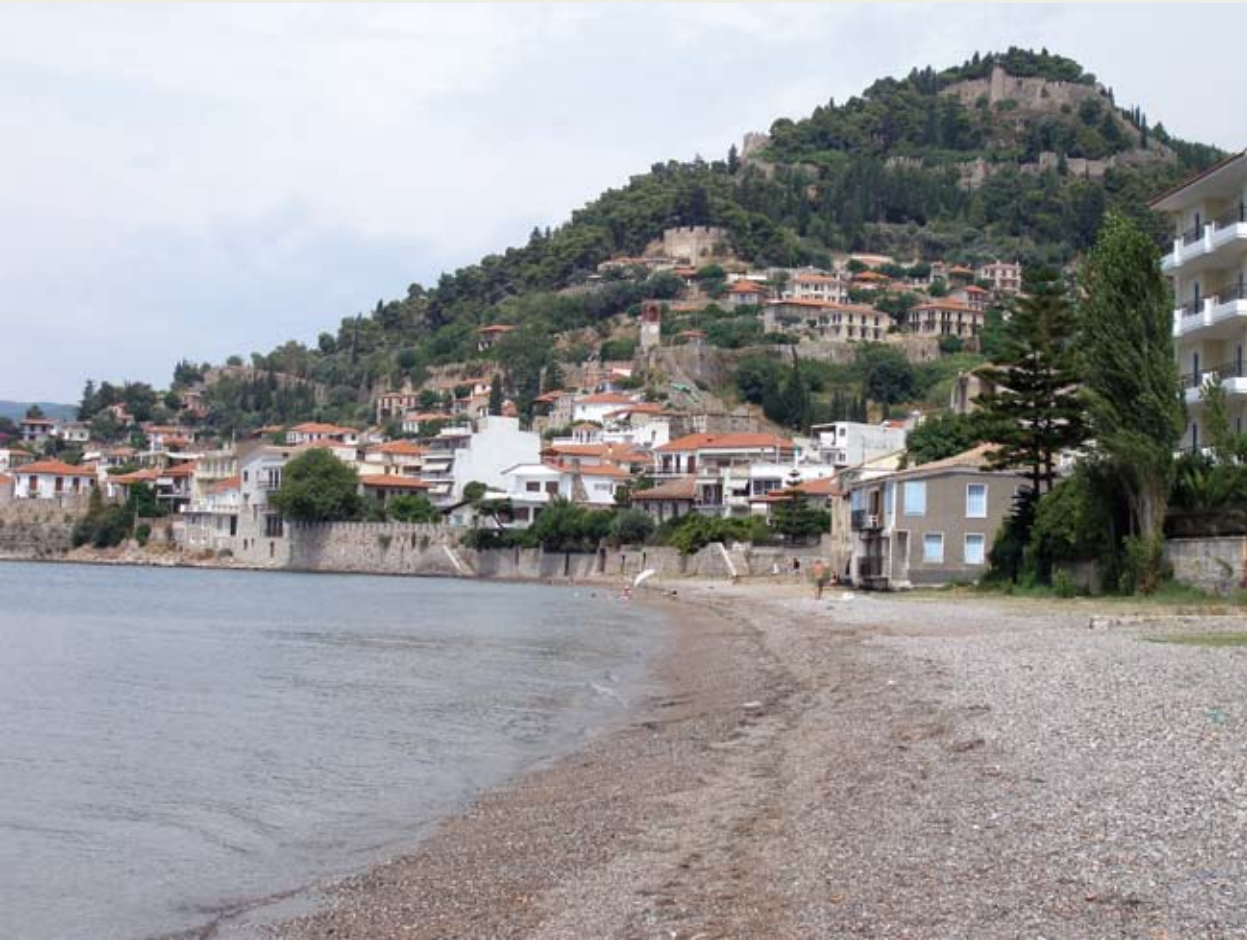
View of the port, town, and castle of Nafpaktos, Greece